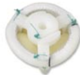
Carpentier-Edwards PERIMOUNT Plus Mitral Pericardial Valve Model 6900P with Tricentrix Holder System

The New Tricentrix Holder System. . . A concentric, tri-tent system designed to minimize suture entrapment. Along with features for ease of use, the Tricentrix holder system maximizes your implantation experience with the Carpentier-Edwards PERIMOUNT Plus Mitral Pericardial Valve.